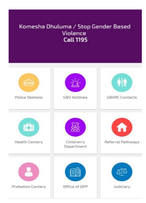
Figure 2: Screenshot of the Komesha Dhuluma landing page

We have also adapted our modes of delivery to ensure that we maintain our commitments to beneficiaries with community-based activities. While not a complete substitute for face-to-face engagement, both programmes have increased use of interactive radio programmes in local dialects. This is helping to ensure that hard to reach groups aren't left behind and enables VAWG awareness efforts to continue despite COVID-19 restrictions.